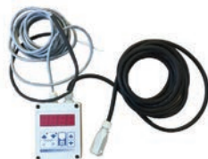
Remote thermostat THK with probe 4150.137