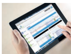
Compatible with Master IMCS