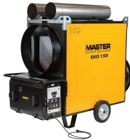
BIG POWER FOR BIG ROOMS!

Most other heaters on the market are incapable of reaching these high temperatures smoothly and are therefore unfit for thermal disinfection.