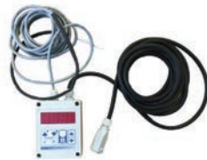
Remote thermostat THK with probe 4150.137