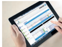
Compatible with Master IMCS