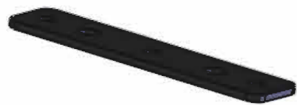
PS082 x 6