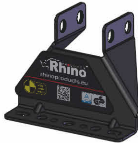
MS168 x 4