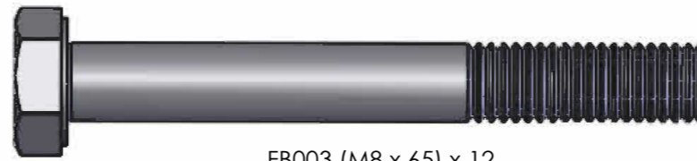
FB003 (M8 x 65) x 12