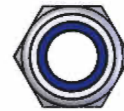
FN006 (M8) x 12