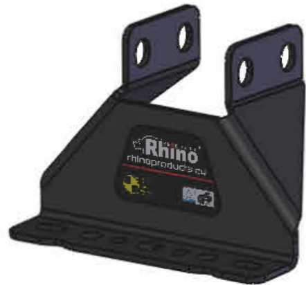
MS199 x 2