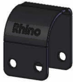
MS201 x 6